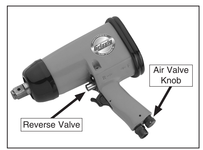
Figure 1. Model G8125

Install any <sup>3</sup>/<sub>4</sub>" drive socket onto your air impact wrench. To change direction, push the reverse valve. To adjust the torque setting, turn the air valve knob from 1 to 6, 1 being the lowest setting ( Figure 1 ). Connect to an air line regulated at 90 PSI.